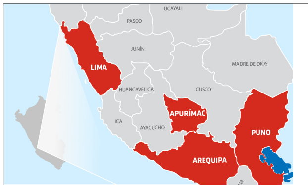
Area of influence: APURÍMAC, AREQUIPA, PUNO, LIMA