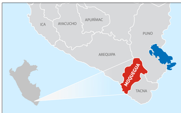
Area of influence: MOQUEGUA